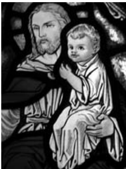
Left: Detail window given by the Crossley family as a thanks offering.