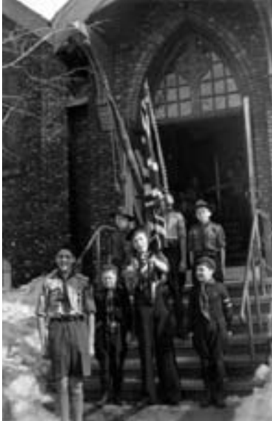
Above: The 29th Scout Troop on Church Parade, February, 1943.