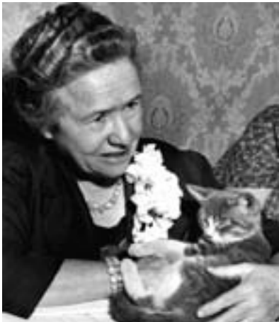
Above: Charlotte Whitton

In both 1958 and 1959, the Annual Diocesan meeting of the Women's Association requested the Synod of Ottawa to admit women. They were turned down both times. A few days after the 1959 Synod on Trinity Sunday, Ottawa mayor, Charlotte Whitton (a devout Anglican), gave a speech. "Nine flourishing dioceses in Canada admit women to Synod, in full voting equality" she boomed, "But Ottawa continues quaint. How quaint! Her Majesty the Queen may be anointed as the deputy governor on earth of the Anglican Church, but she couldn't enter or vote on putting a levy on Ottawa parishes to lift the debt..." The Diocese of Ottawa did not admit women to its synod until 1967.