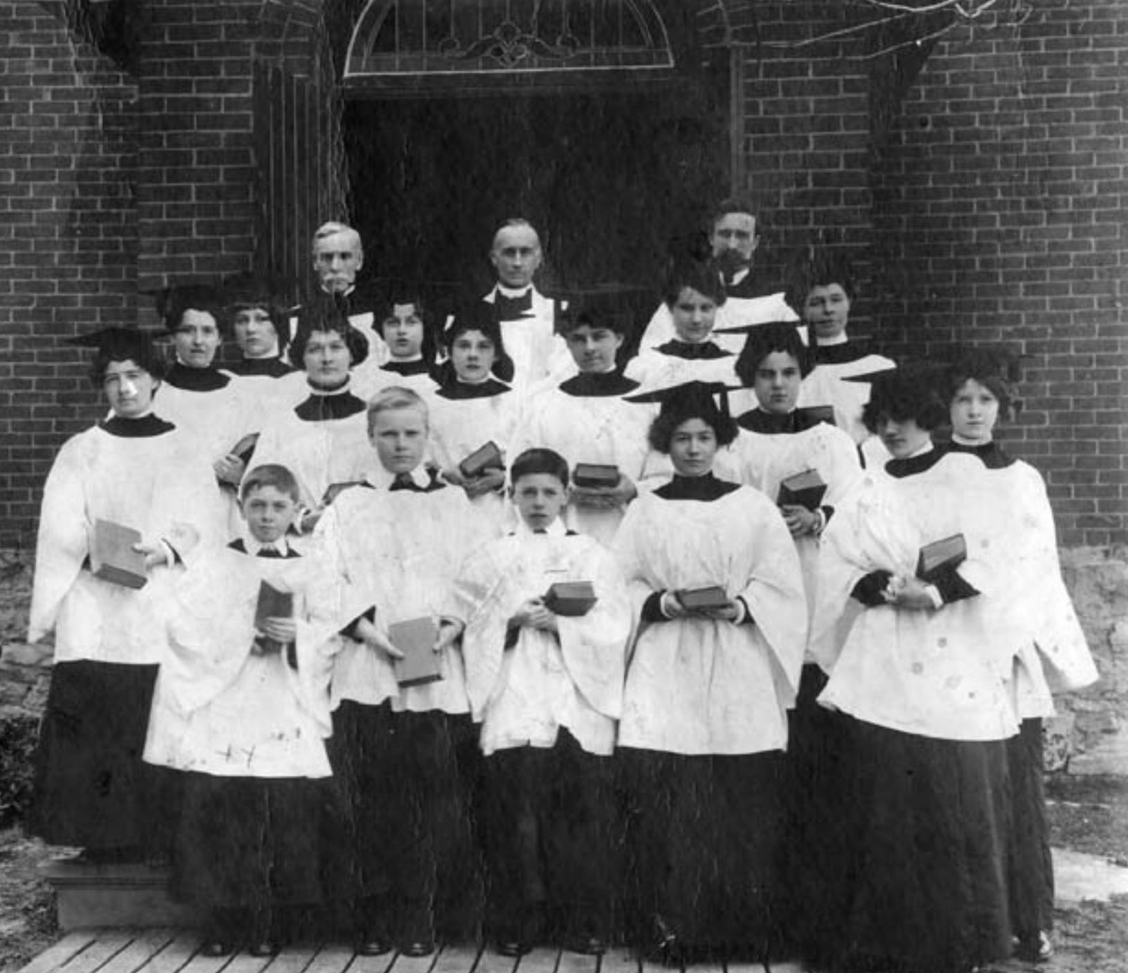
The New Parish